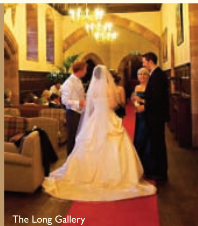
The Long Gallery